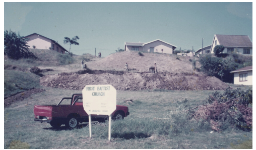
Land in Southgate