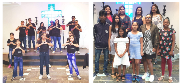
The current Sunday School