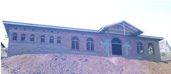
This is the Lords doing and its marvelous in our eyes. Psalms 118:23