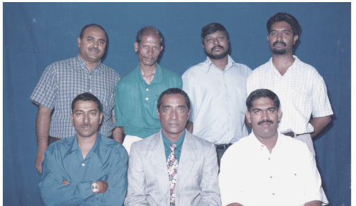
Church Council of 1999