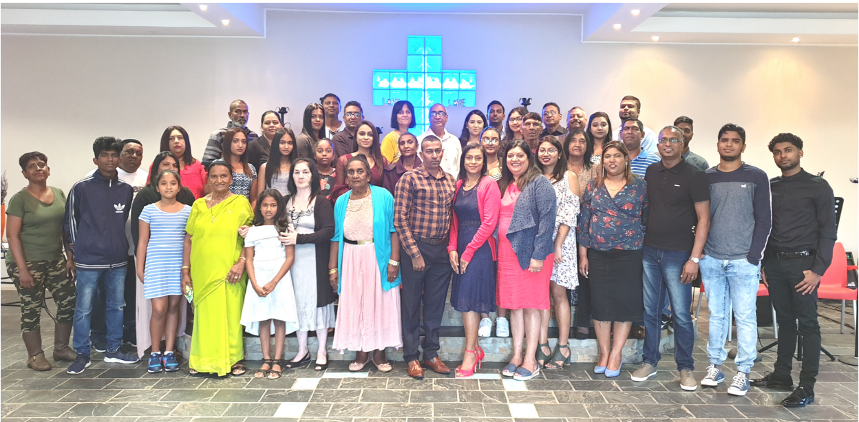
Part of the First Baptist Congregation in 2019

We are a family on a mission to build His house, for His fame in His world.