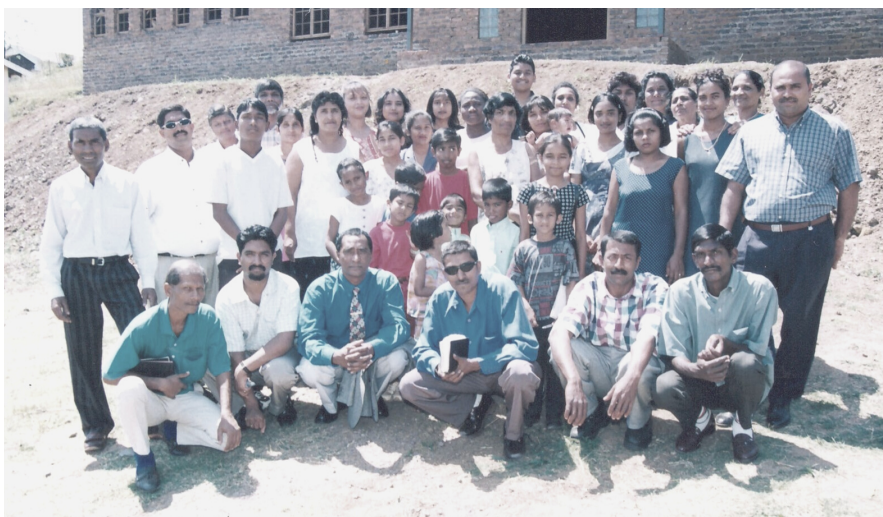
Part of the First Baptist Congregation in 1999